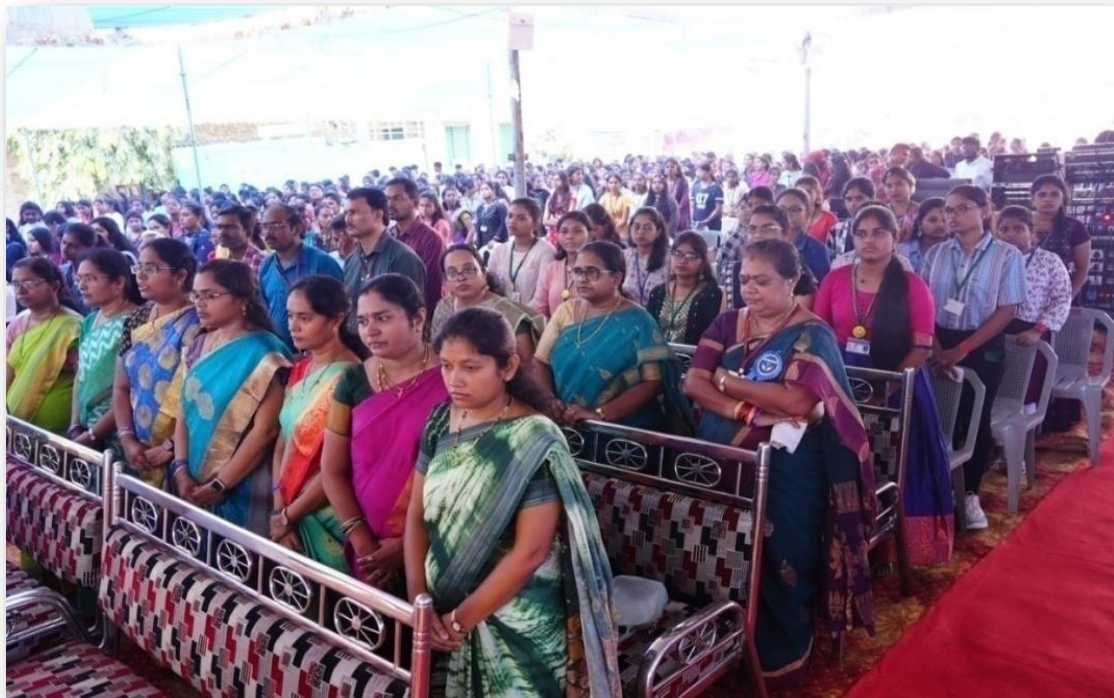
COLLEGE OPEN AUDITORIUM