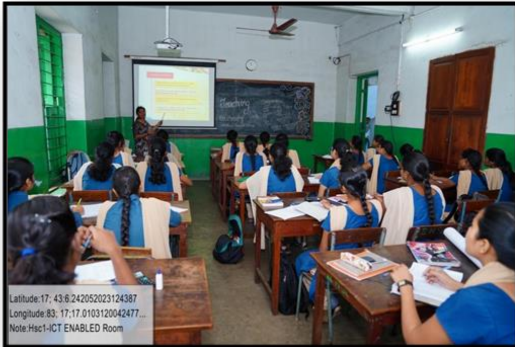
GENERAL CLASS ROOM

Latitude:17; 43;6.242052023124387 Longitude:83; 17;17.0103120042477... Note:Hsc1-ICT ENABLED Room