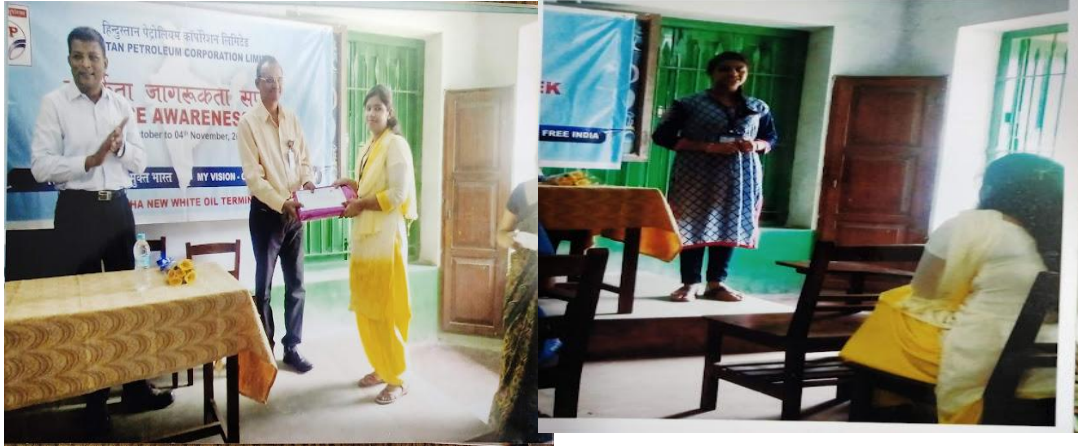
Elocution On Corruption Free India