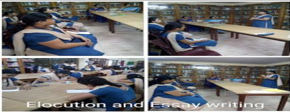
Elocution and Essay writing Competition 27/6/2018