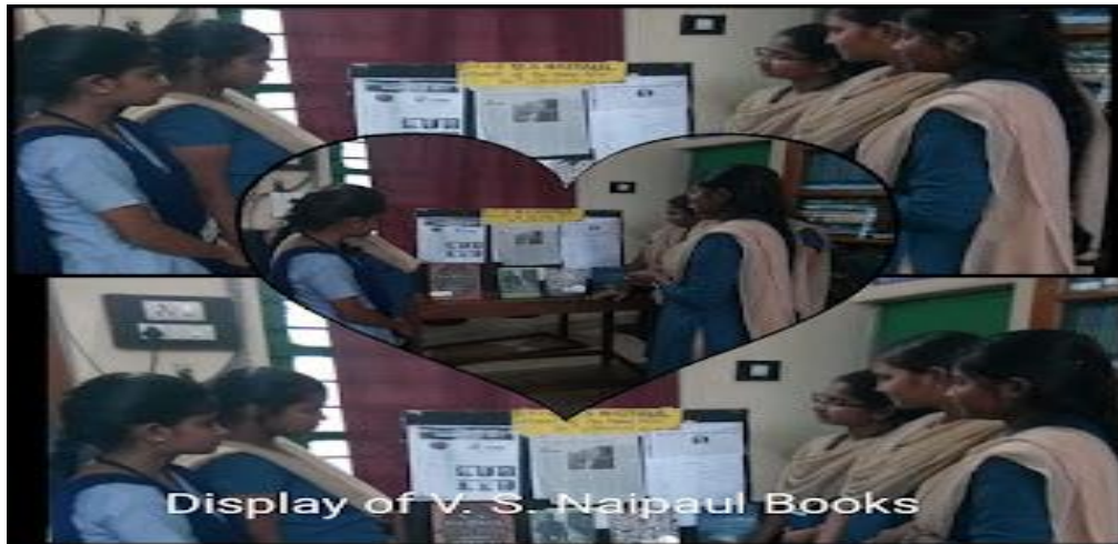
V.S Naipaul Books Display 13&14/8/2018