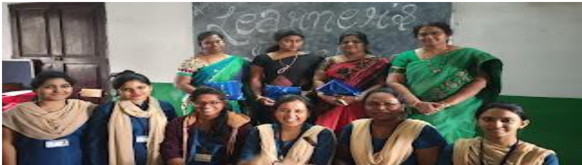
15/6/2018 Learner's Destiny Club Formation