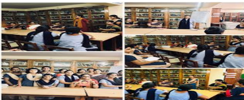
Book Talk on the book "I am Malala" 16/7/2018