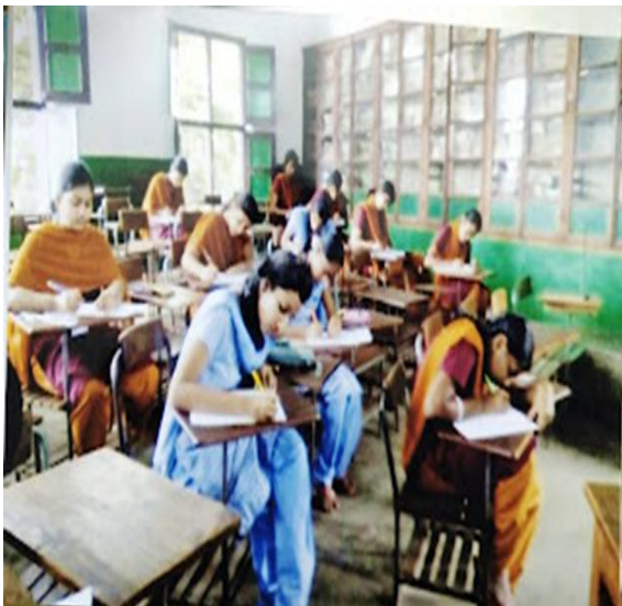
Essay Writing On Corruption Free India