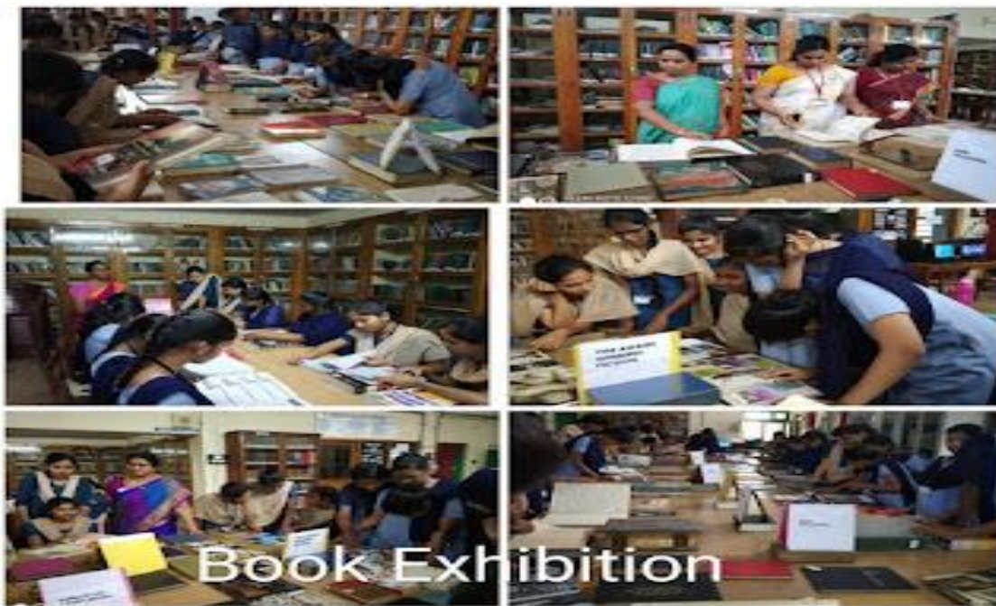
BOOK Exhibition: Rare & Special Collection 14&15/11/2018